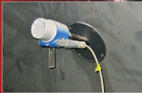
Using level sensing in biomass power