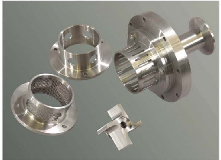
Figure 1. Inline High Shear Mixers are offered with a variety of interchangeable stator designs to fine-tune particle size reduction, emulsification, residence time, temperature rise and throughput.

"Our Inline high shear mixers are typically used for mixing