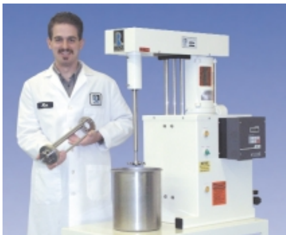
Rigorous methodology in most coatings development labs today requires the ability to compare test results using a rotor/stator mixer and a traditional high-speed disperser.

A mixer that allows you to bolt on a variety of agitators certainly saves space in the lab. By doing