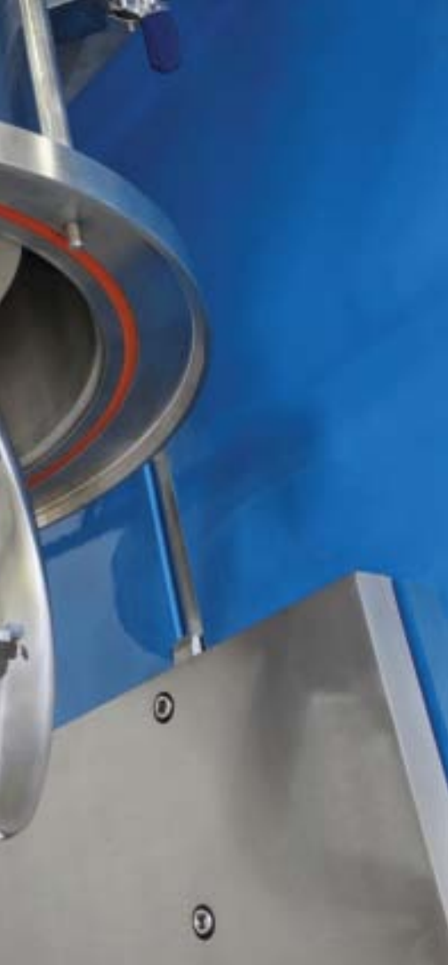
Planetary dual disperser.

rior. Batch components are constantly recombined and physically moved from one area of the vessel to another until a homogenous state is achieved.